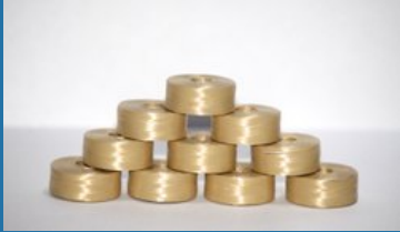
Prewound Bobbin For Sewing And Embroidery