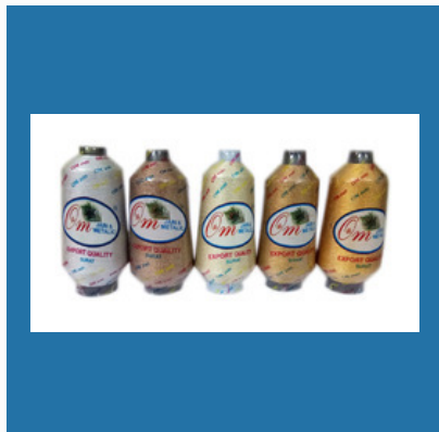
Neem Zari Thread