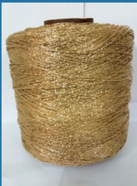
Embroidery Diamond Dori