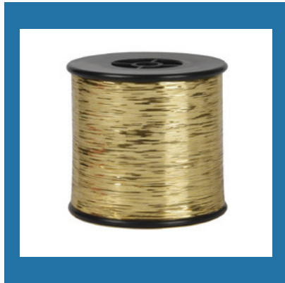
M Type Metallic yarn