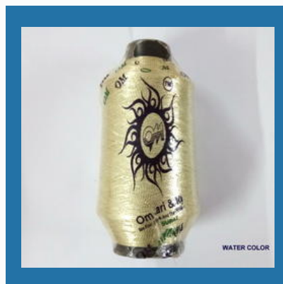
Fancy Badla Zari Thread