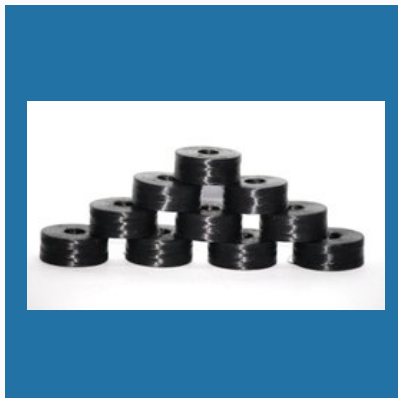
Prewound Bobbin for Embroidery and Sewing