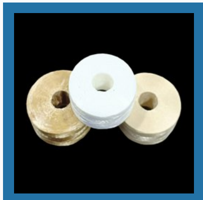
Embroidery Ready Bobbin Thread