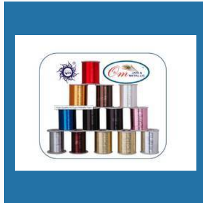
M Type Metallic Yarn