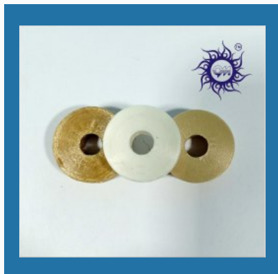
Pre-Wound Ready Bobbin For Embroidery