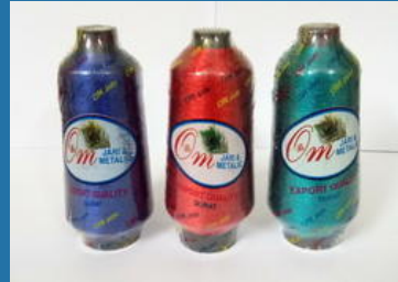
Multicolor Embroidery Zari Thread