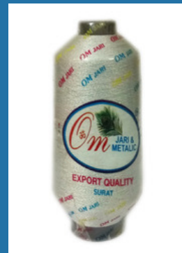
MH Type Metallic yarn