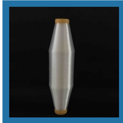
Polyester Monofilament Yarn