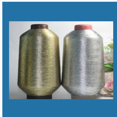
MX Type Metallic Yarn