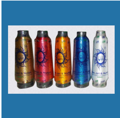
Nylon Monofilament Yarn