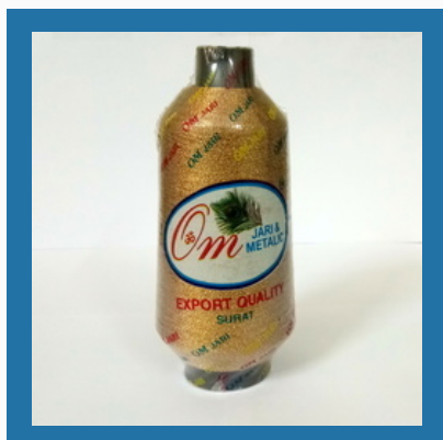
Embroidery Neem Jari Thread