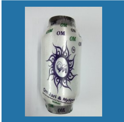
Polyester Monofilament Yarn - OM 10 mm