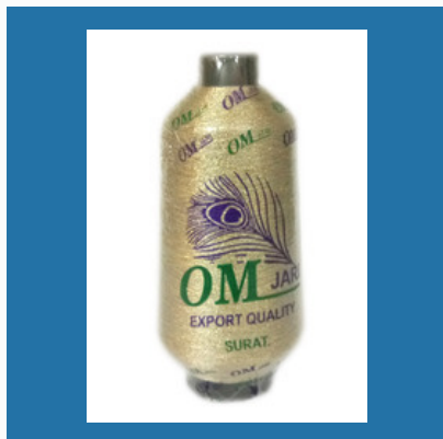
ST Type Metallic Yarn